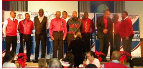
St. James Male Choir provided entertainment for guests at the BICC Assembly.